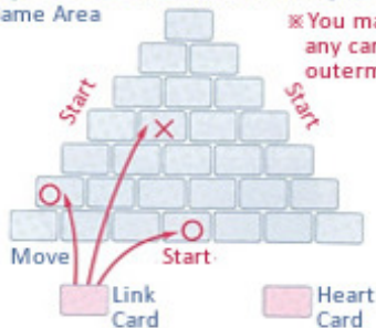
Fig. 1 Game Area